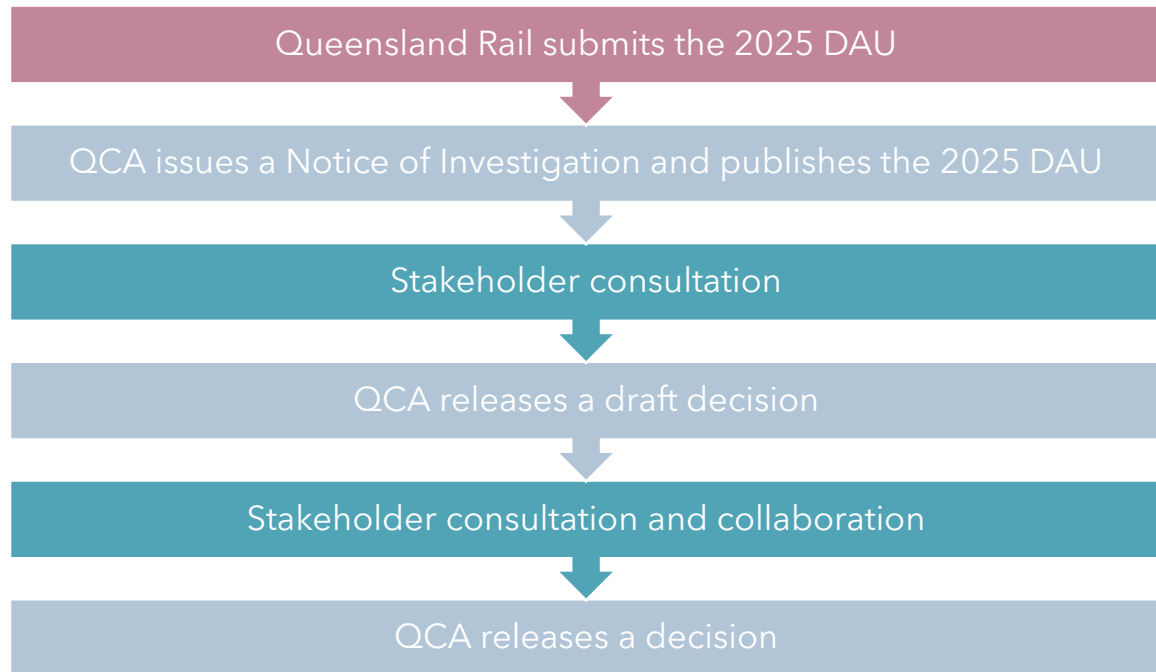
Figure 1 Indicative 2025 DAU assessment process

We intend to incorporate additional processes where we consider they will provide for a more transparent and effective 2025 DAU assessment. For instance, in addition to consulting on Queensland Rail's DAU and our draft decision, we may seek further stakeholder submissions on specific matters.