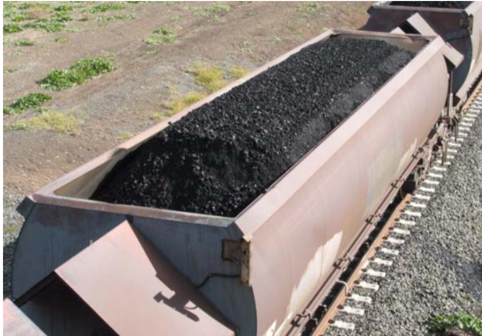
Figure 2 - Top of loaded coal wagon showing 'Garden Bed' style profile.