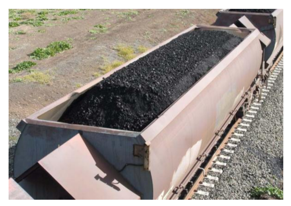
Figure 2 - Top of loaded coal wagon showing 'Garden Bed' style profile.